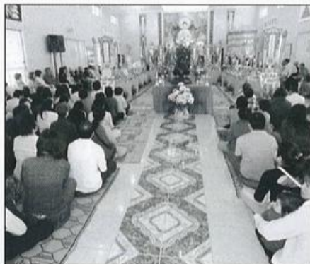
Above: Some of the crowd at the Brisbane Holy Relic tour; and right: Vietnamese Sangha at Brisbane Holy Relic tour.

The tour of Gympie / Sunshine Coast planned for February 2006 has been cancelled due to other commitments. It is expected that the Great Stupa Holy Relic tour will return to Brisbane in 2007.