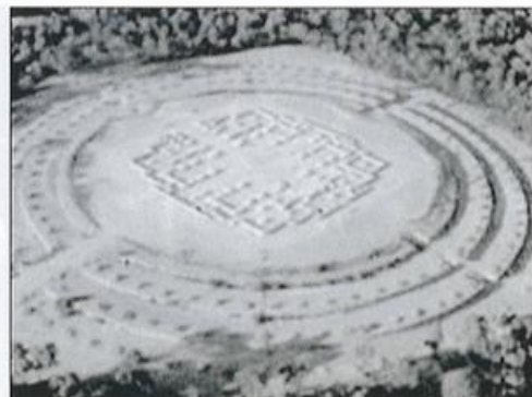
An overhead of the foundations of the Great Stupa taken from a hot air balloon in November, 2004.

The name of each Brother or Sister will be inscribed in perpetuity on one of the four sides of the great base on which the Buddha will be positioned. Please note that a group of people may join together to be joint Buddha-base benefactors.