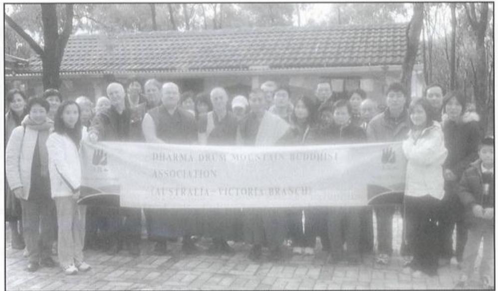
Group from Dharma Drum Mountain (Melbourne) visited the Great Stupa Exhibition centre on Sunday, June 19.

She will use the machine to prepare decorations for the Exhibition Centre and the Great Stupa.