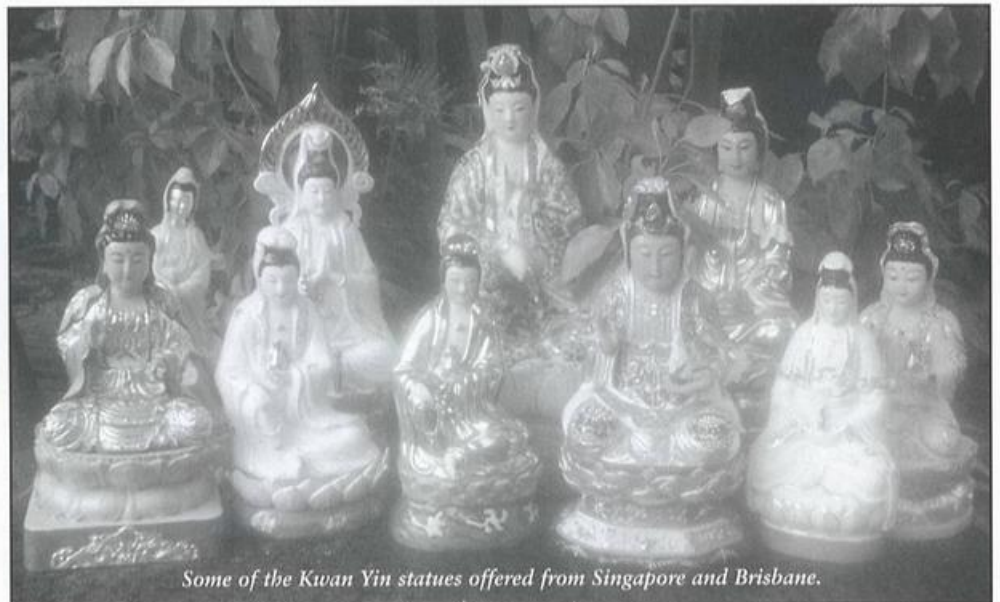
Some of the Kwan Yin statues offered from Singapore and Brisbane.