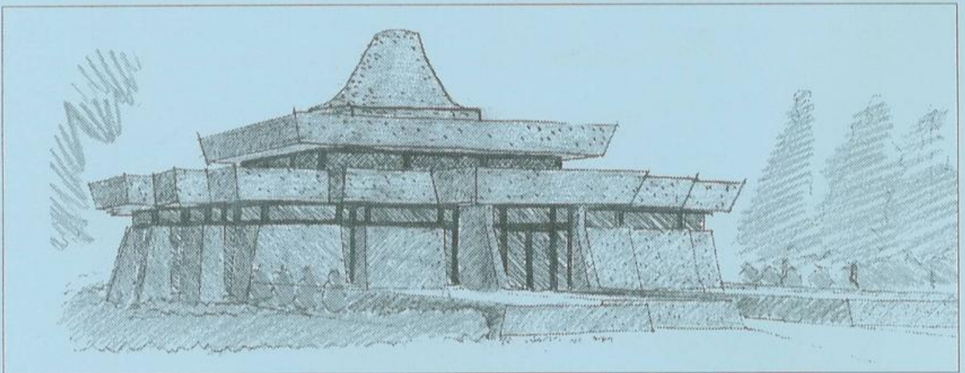
• Perspective view of the Visitor Reception Centre