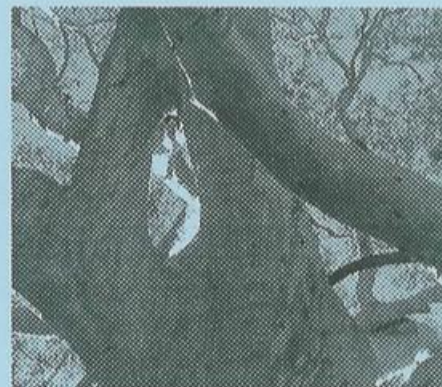
The ring created by Aborigines of the old time.